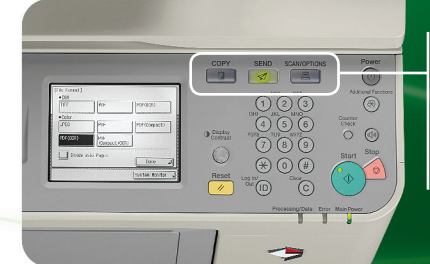
Quick Access Buttons Copy, Send, and Scan/Options buttons accelerate common workflows without having to navigate layers of screens.

For everyday copies or scans, users can scan individual pages on the platen glass or quickly tackle a stack of single- or double-sided originals using the optional 50-sheet Duplexing Automatic Document Feeder. The color scanning unit uses a compact and lightweight high-precision reader that makes crisp, clear reproductions.